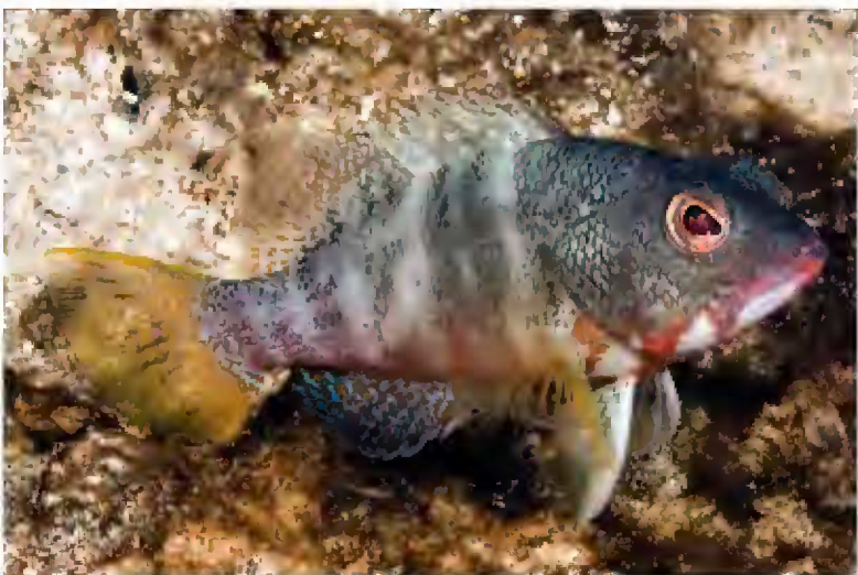
FIGURE 4. Color of paratype ZSM 43880 shortly before capture.